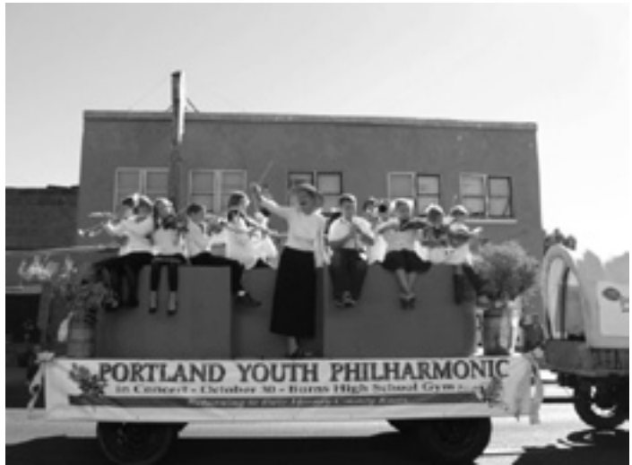
The Portland Youth Philharmonic returned to its roots in Burns for a concert in October 2010.