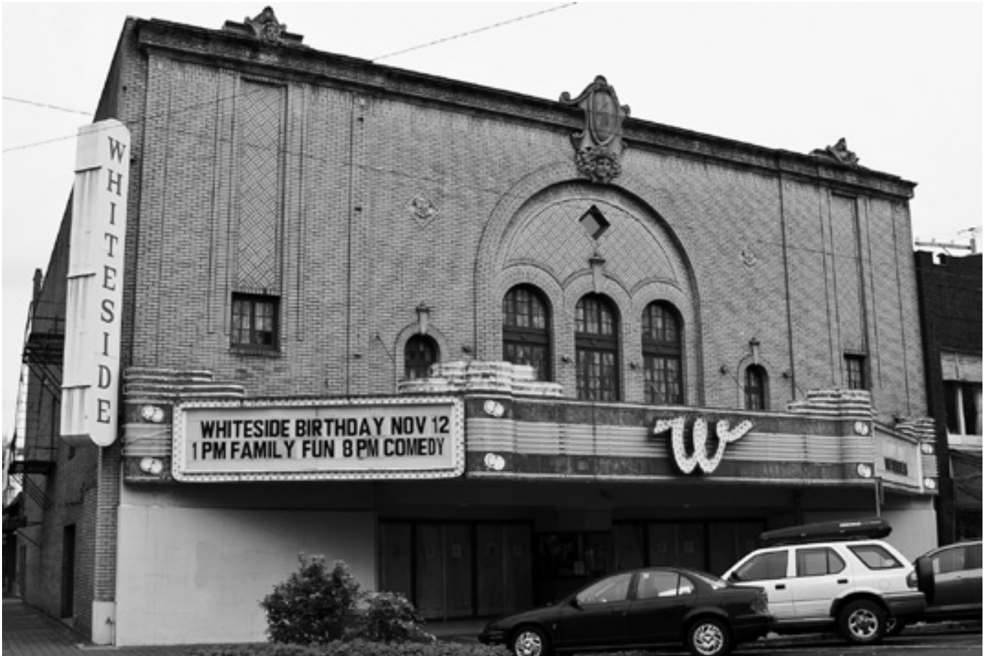
The first task in restoring the Whiteside Theatre was repairing sewers and plumbing fixtures that kept the building closed.