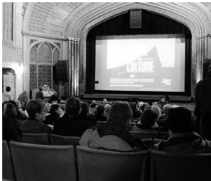
Meek's Cutoff, filmed in Harney County, was shown at the Elsinore Theatre in Salem.

Through a partnership with the Governor's Office of Film and Television, a special screening of the feature film Meek's Cutoff took place in Salem's Historic Elsinore Theatre on March 15, 2011 – and benefited the Cultural Trust. The event generated over $7,000.